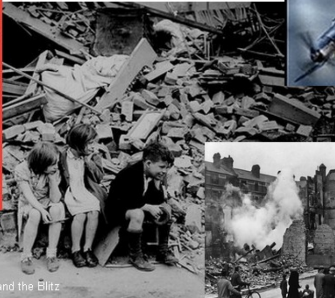
Children and the Blitz